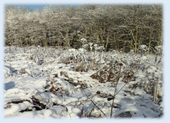
Meadow during Winter