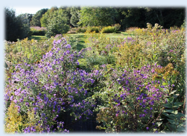
Meadow during Fall