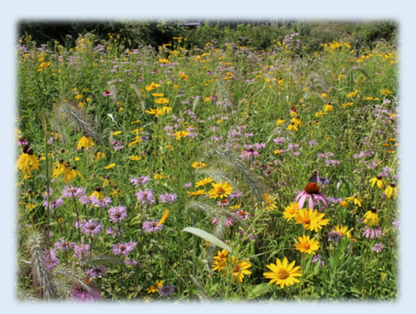
Meadow during Summer