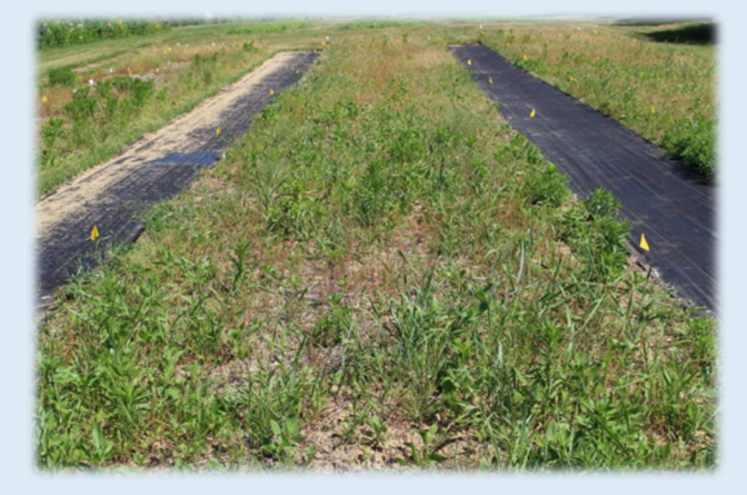
Meadow during first growing season

Meadows do not need a dormant season mowing every year. This is only necessary to keep shrubs or trees from growing up. Continue to monitor for aggressive weeds or invasives. You may hand remove these species during the fall when you are able to take the root completely out. Try not to do this too often as it may allow for more weeds or invasives to grow in the future. If you have a larger meadow, consider only mowing 1/3 or 1/4 of your meadow and leave the rest for wildlife habitat during the winter season.