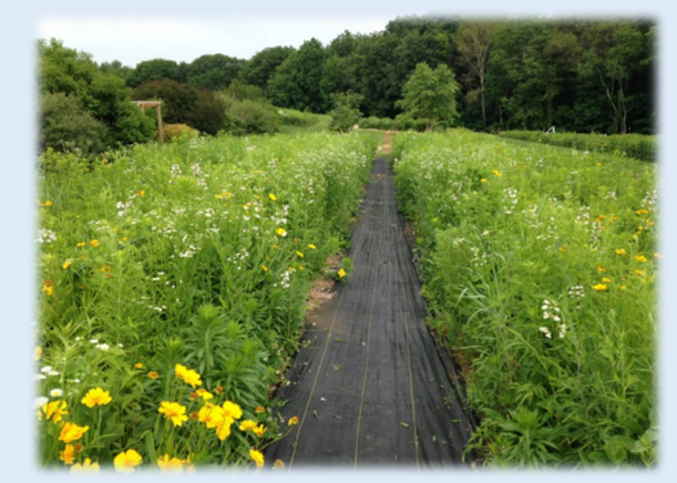
Meadow during second growing season